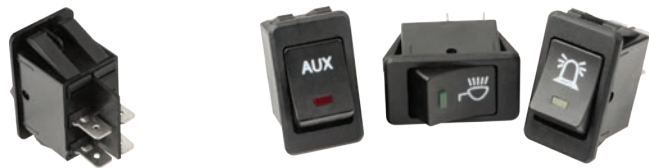
Rocker switches with symbol