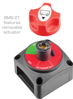
BMS-21 features removable actuator