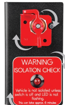
BMS and Warning Panel can be oriented to suit application