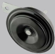
Disc Horn (D2H24)