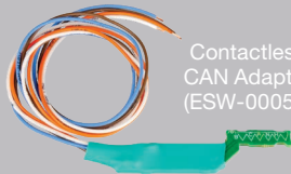
Contactless CAN Adaptor (ESW-00050)